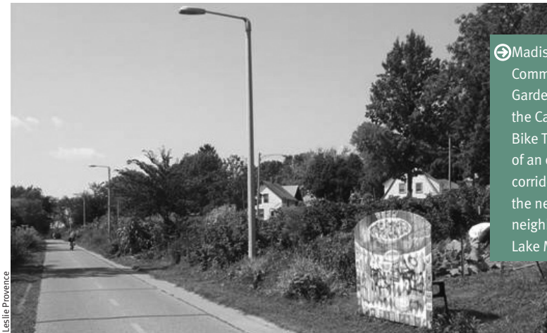
➔ Madison's Atwood Community Garden, along the Capital City Bike Trail, is part of an open space corridor between the nearby urban neighborhood and Lake Monona.

intensive urban agricultural. While another city may consider the same activity as less intensive and may want to promote it on a wide scale. We suggest that cities use broad definitions and permissive development standards that promote creative experimentation from organizations and citizens. While this experimentation won't always be free of conflict, we believe the benefits of a permissive approach will help reconcile differences and promote positive relationships.